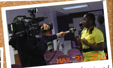
MAY 21, 2012 JSell student being interviewed by Brooklyn News 12