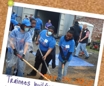
MAY 24, 2012 Trainees building a playground at CCC!