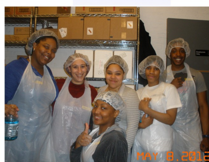
MAY 8, 2012 Service Learning at St. John's Bread and Life Soup Kitchen