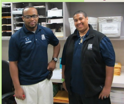
Employer Spotlight: Dynamex