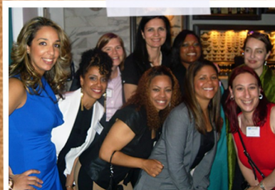
Our beautiful OBT staff!!!