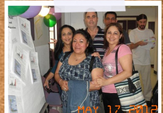
MAY 17, 2012 JSell students!!!