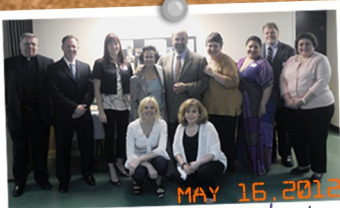
MAY 16, 2012 St. Anselm Workforce Ministry Resume Workshop. Provided by OBT