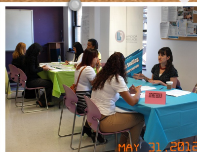
MAY 31, 2012 On-site Career fair, OBT Bushwick