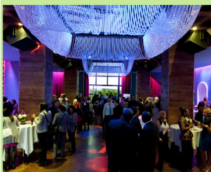
Summer Soirée a Success!