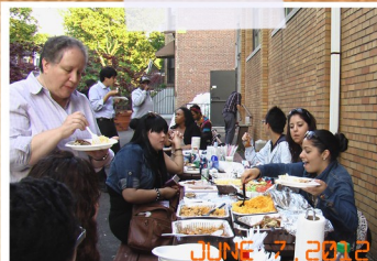
JUNE 7, 2012 Stay At Work (SAW) Program's summer picnic