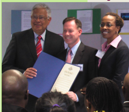
NY Secretary of State Visits JSELL