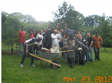
MAY 23, 2012 Service Learning at Prospect Park