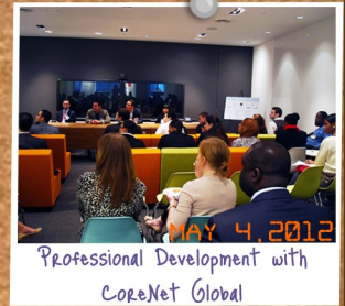
MAY 4, 2012 Professional Development with CoreNet Global