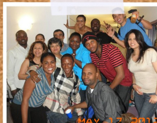
MAY 17, 2012 JSell students at the Immigrant Heritage Celebration