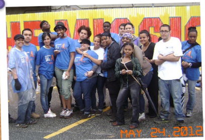
MAY 24, 2012 Service Learning at Calvary Community Church (CCC)