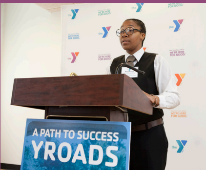
First Y Roads Center Opens in Jamaica, Queens