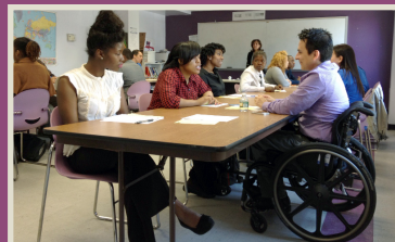
Goldman Sachs Speed Networking