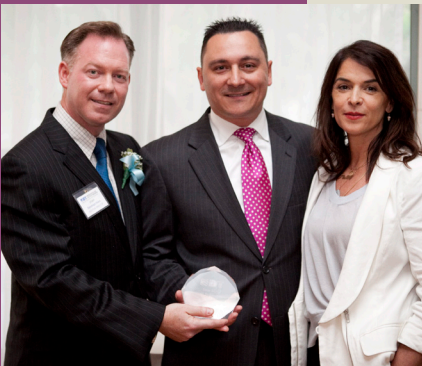
Summer Soiree 2013!