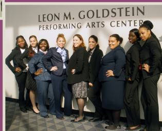
Governor Cuomo's State of the Budget Address