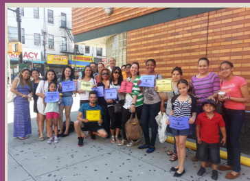
ONA Students Field Trip