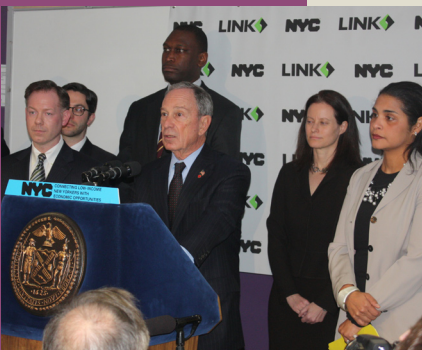
Mayor Bloomberg Recognizes OBT